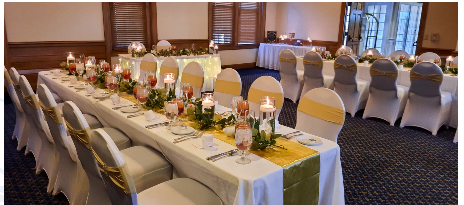
Coyle Gathering Room